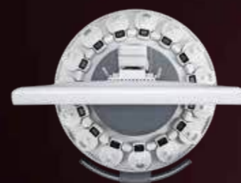
FTS-6 Central Monitoring System